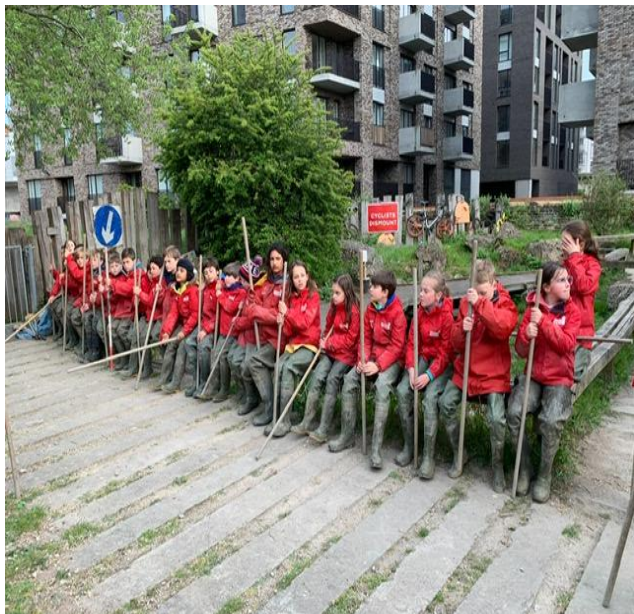
Some examples of our Cub's activities over the last year