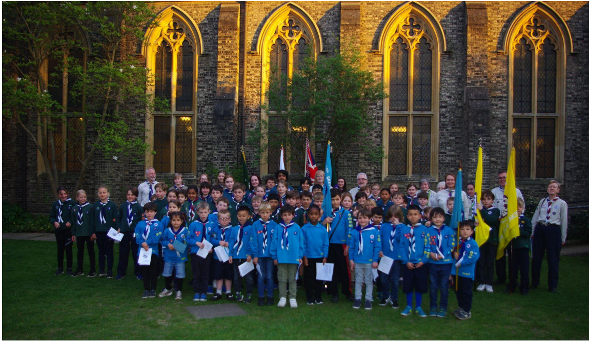
St George's Day, April 2022, St Michael and All Angels Church