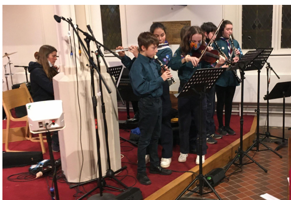
Scout Award Evening at St Michael's and All Angels Church